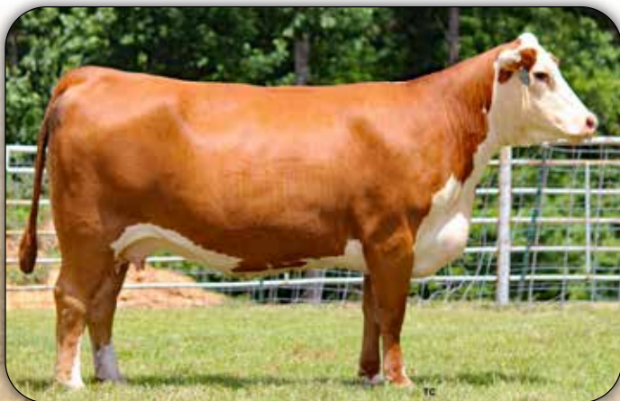
WHR 4013 619B BEEFMAID 639F - Dam of Lot 64.