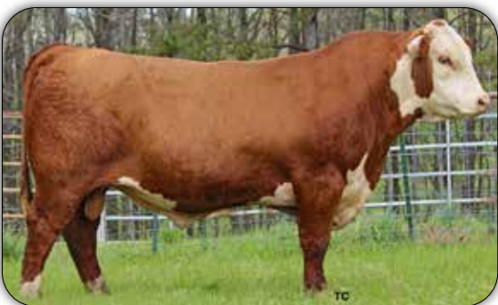
WHITEHAWK NATIVE 490H ET - Maternal brother to Lot 11.