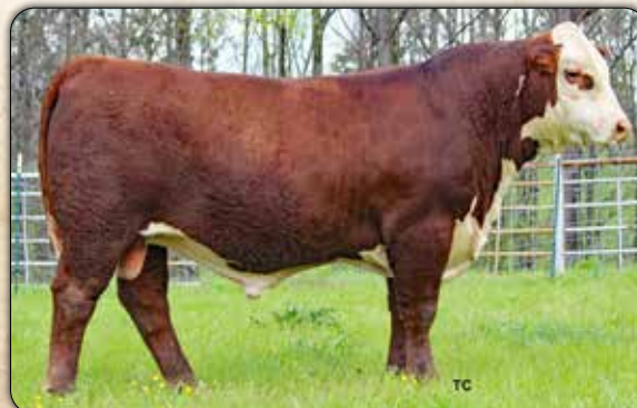
WHITEHAWK 593F REACHER 660J ET