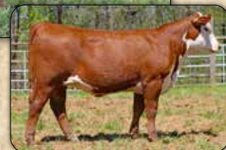
WHR 210F 647B BEEFMAID 124K - Lot 10A, born 7/22/2022.