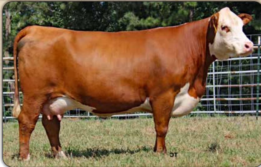
WHR 845C 4010 BEEFMAID 590F ET - Sire of Lots 48A, 48B and 48C.