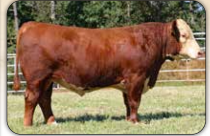
WHITEHAWK 838F MARSHALL 870J