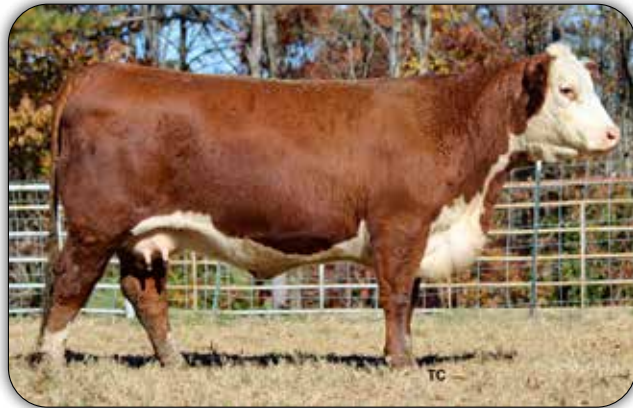
WHR BEEFMAID 4013 191 531ET - Dam of Lot 51.