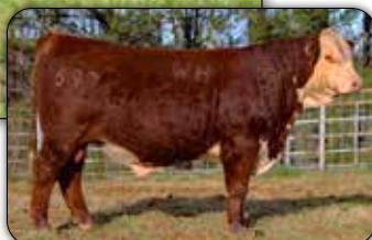
WHR 845C 592F BEEFMAKER 697J - Service Sire to H80