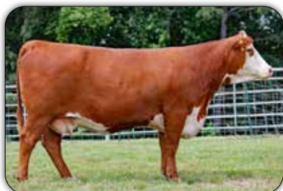
/S LADYHOMETOWN 5407C ET - Dam of Lot 44.