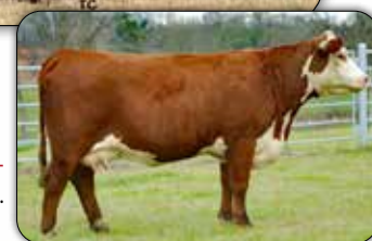
KCF MISS REVOLUTION Z298 ET - Dam of Lot 77.