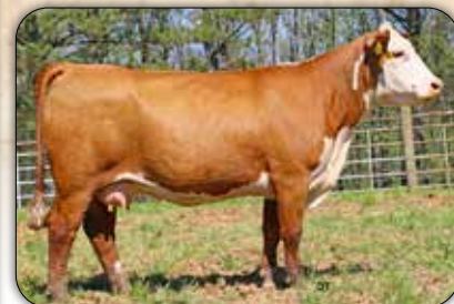
WHR 493E 589F BEEFMAID 439H - Dam of Lot 43.