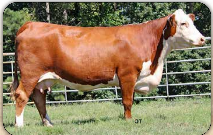
WHITEHAWK 225 BEEFMAID 619B ET - Maternal Granddam of Lot 64