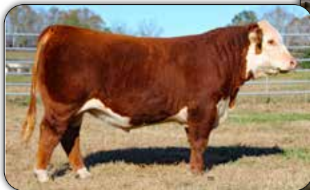
White Hawk 299G - Full brother