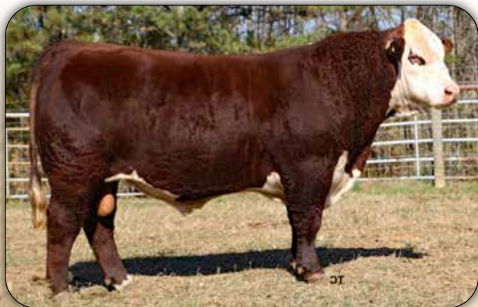
WHITEHAWK 590F OUTLIER 778J ET