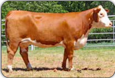
WHITEHAWK X51 BEEFMAID 738B - Dam of Lot 52.