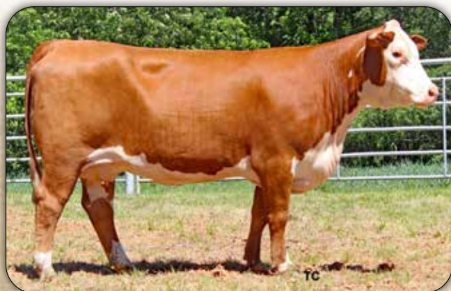
738B - Maternal Granddam