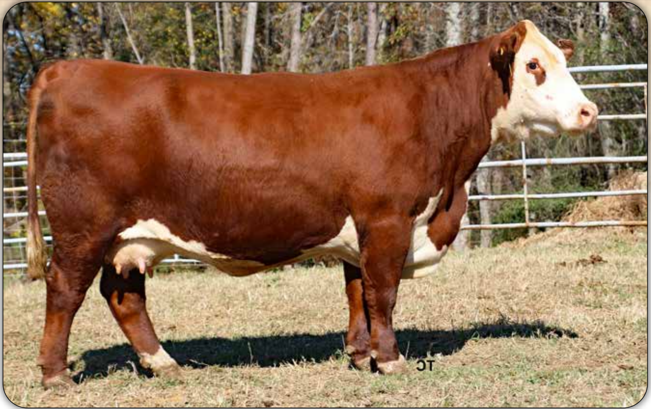
RHF 711 MY GEM 8094F - White Hawk Ranch and Stone Ridge Manor selected from the Roth Dispersal. We were looking for an outcross female to incorporate into our breeding program that had outstanding phenotype and strong maternal genetics. Gem 8094 fits the criteria.