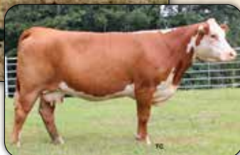
KCF MISS BONANZA B359 - Dam of Lot 19