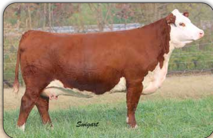
NJW 91H 100W RITA 31Z ET - Paternal Granddam