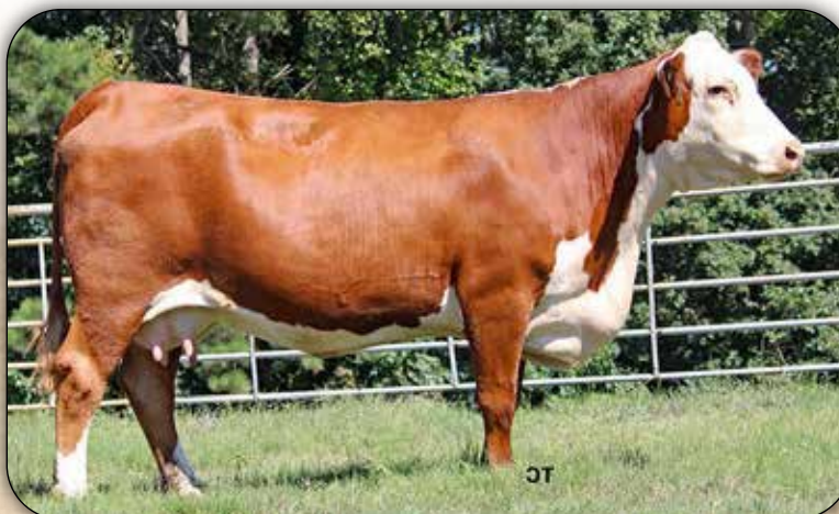
WHITEHAWK 225 BEEFMAID 619B ET - Dam of Lot 69.