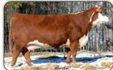
KCF MISS 9126J T306 - Maternal Granddam of Lots 59 and 60.