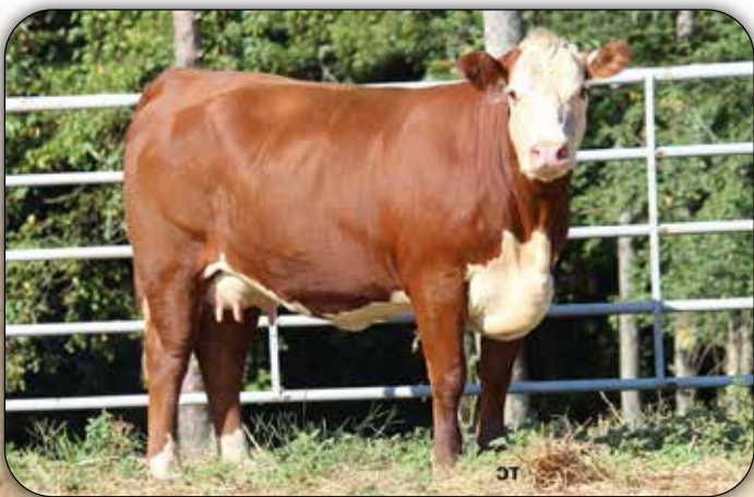
INNISFAIL 723 U208 4010 ET - Dam of Lot 75.