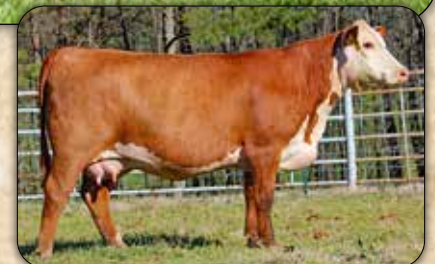
WHR 4013 820C BEEFMAID 659F - Dam of Lot 14