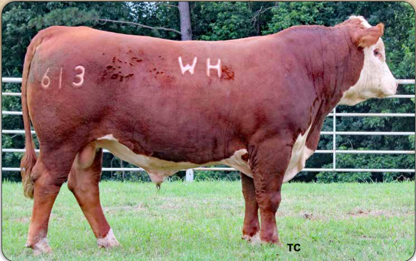
WHR 5344 4015 BEEFMAKER 613FET - Sire of Lots 79 and 80.