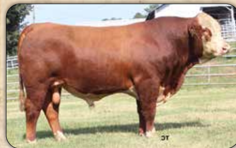
WHR BEEFMAKER B262 636C 388E - Sire of Lot 45.