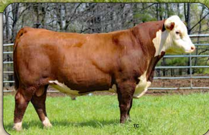
WHITEHAWK CAPTAIN 424H ET - Full Brother