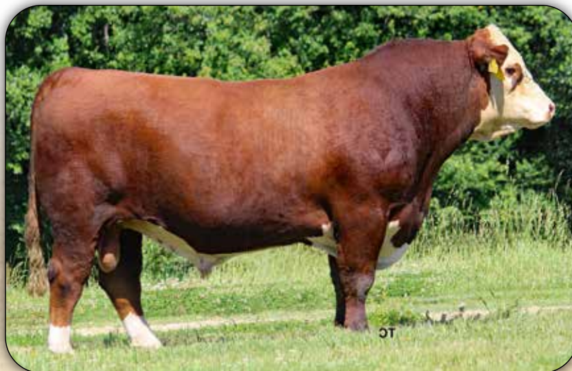
Whitehawk Chief 318G - Full brother to Lots 1 and 2.