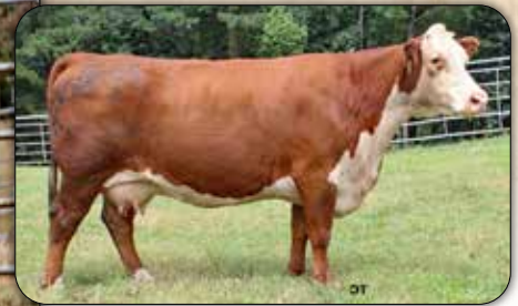
Whitehawk 0102 Beefmaid 526A- Dam of Lots 6 and 7.