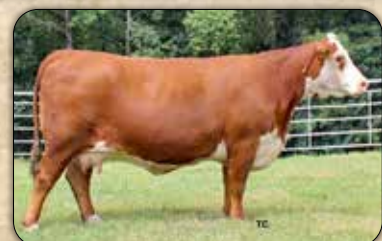
RMB SOUTHERN LADY 0306A ET - Maternal Granddam of Lot 61.