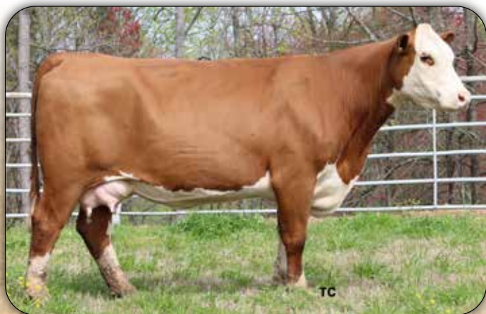
WHITEHAWK P152 BEEFMAID 854CET - Maternal Granddam