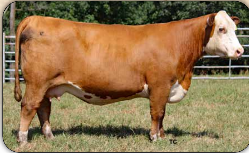
WHR 4013 854 BENEFACRESS 650F - Dam of Lots 3A and 3B.