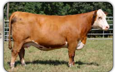
WHR 4013 854 BENEFACTRESS 650F - Full sister to Lots 1 and 2.

2 WHR 4013 854C BEEFMAID 301G ET (DLF,HYF,IEF,MSUDF,MDF) Calved: 9/2/19 Cow 44061973 Tattoo: 301G Polled