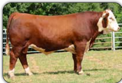
WHITEHAWK NATIVE 490H ET - Sire of Lot 54A.