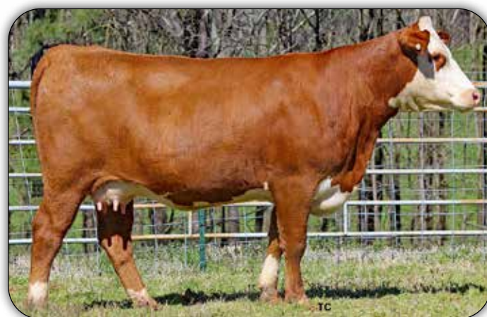
WHR 342Z 115 BEEFMAID 494E ET - Sire of Lot 90 embryos. Owned with Colton Pollard.