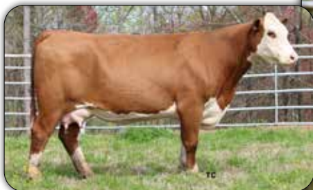
WHITEHAWK P152 BEEFMAID 854CET - Dam of Lot 1.