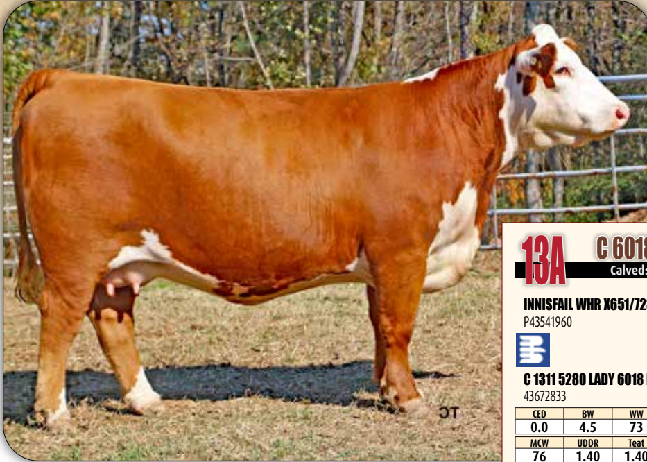
C 6018 X651 LASS 0067 ET