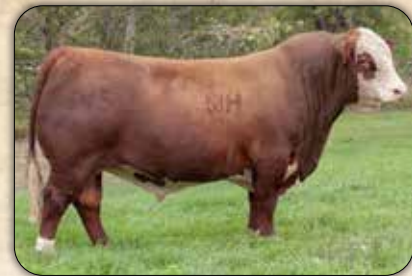
WHITEHAWK WARRIOR 845C ET - Sire of Lot 53.