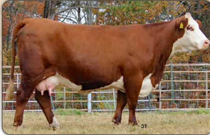
WHR 845C 4010 BEEFMAID 593F ET - Sire of Lot 50.