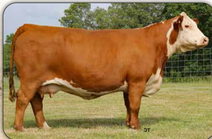
FPH MS REVOLUTION C144 - Paternal Granddam of Lot 83.