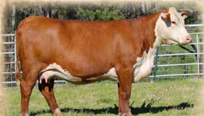
WHR 4013 837C BEEFMAID 641F 01/29/2018