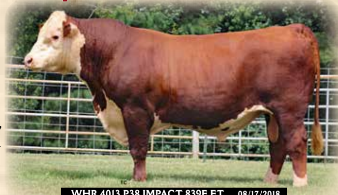
WHR 4013 P38 IMPACT 839F ET 08/17/2018