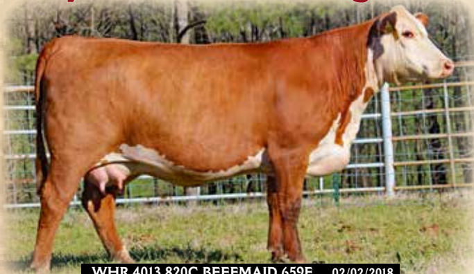
WHR 4013 820C BEEFMAID 659F 02/02/2018