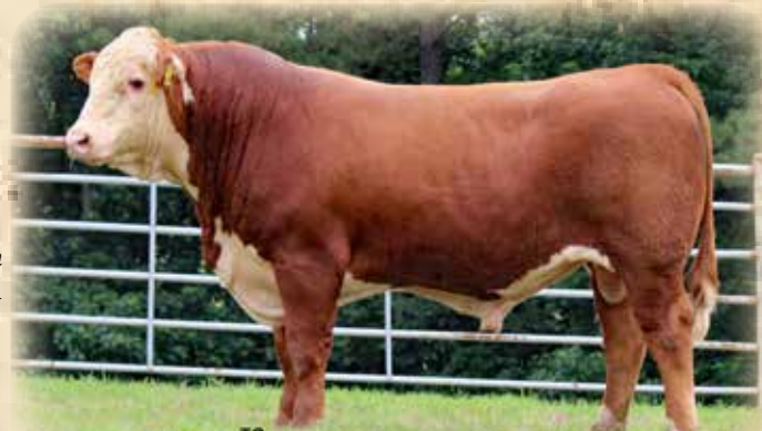
WHR 4013 C144 BEEDMAKER 624FET 01/24/2018