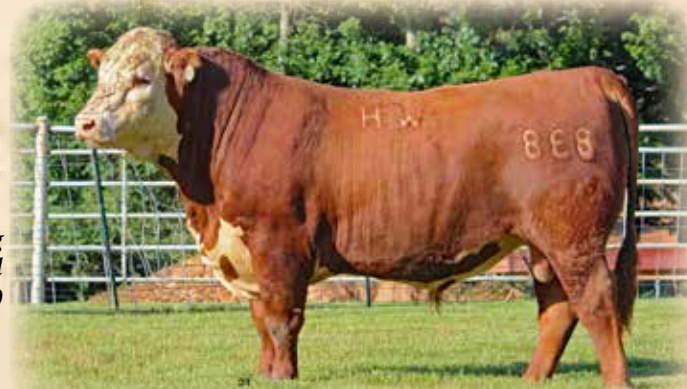
WHR 4013 800C ADVANCER 838F ET 08/16/2018