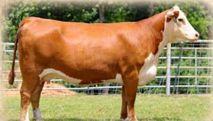
WHR 4013 619B BEEFMAID 639F 01/29/2018